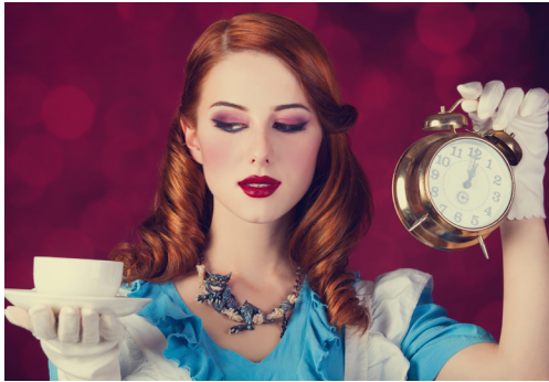
Fantastical Tea Party